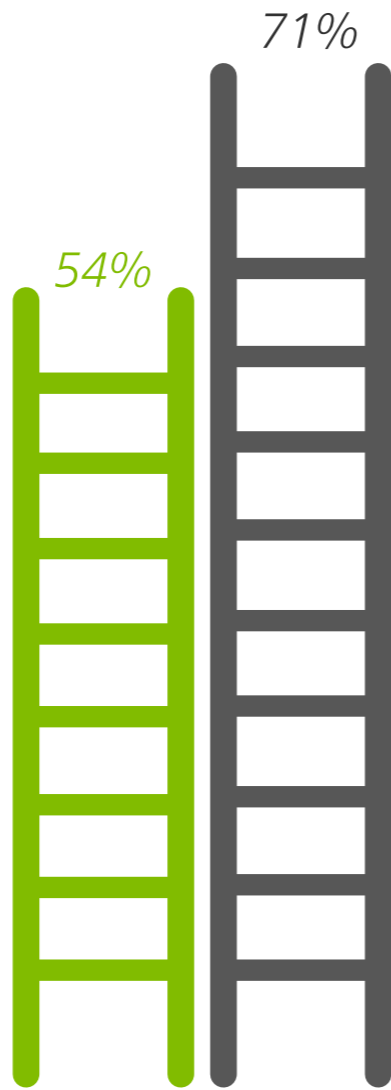
“My leadership skills are not being fully developed” (Average = 63%)