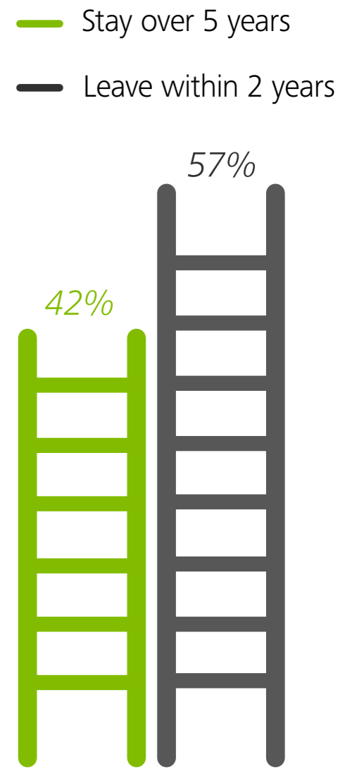
“I feel that I'm being overlooked for potential leadership positions” (Average = 49%)

— Stay over 5 years — Leave within 2 years