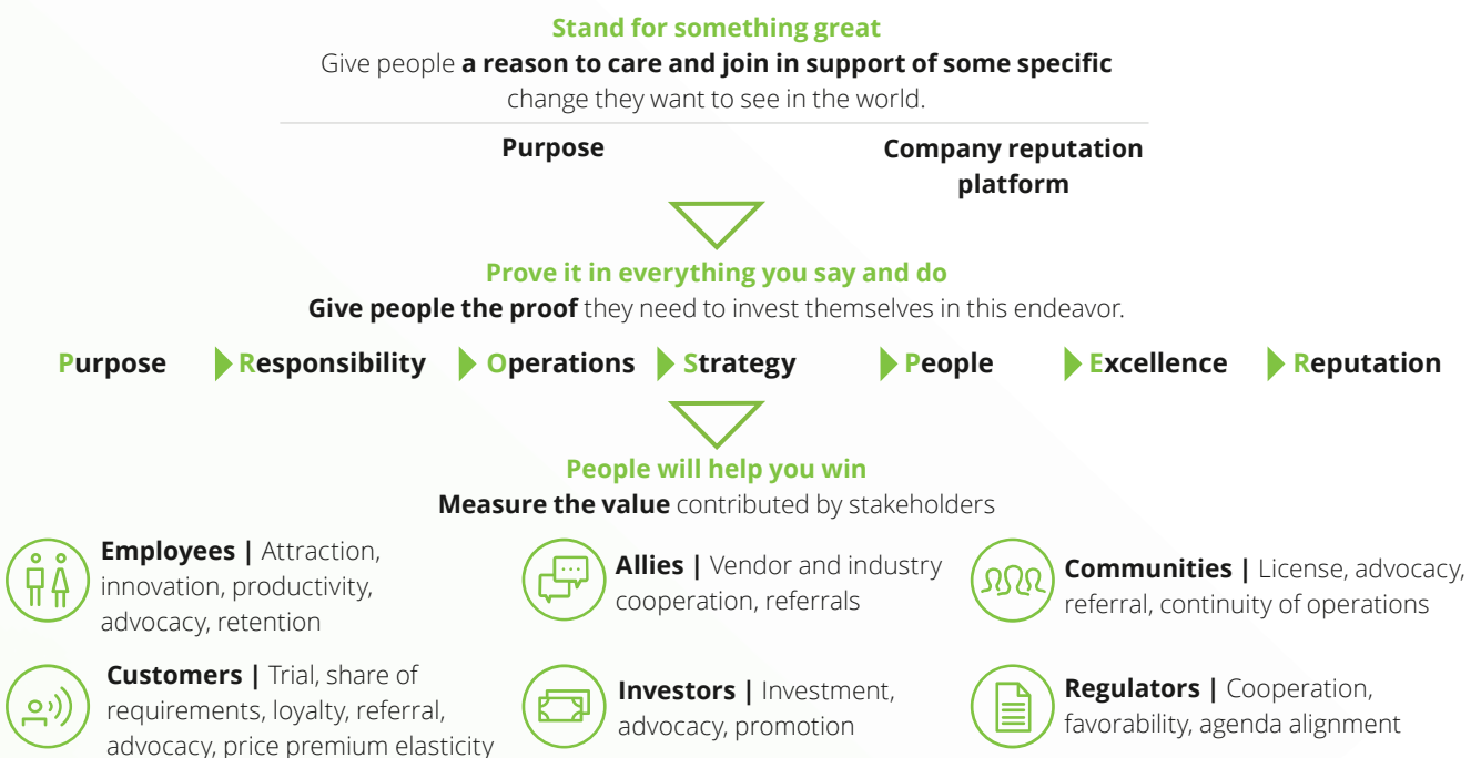
Figure 1: Steps to operationalizing purpose

There is a tremendous opportunity for forward-thinking mining and metals companies to reorient their corporate brands and to become instruments of progress and idealism, increasing their profit growth and product demand as a result. The environmental and social challenges that we see today are the harbingers of change, and society is asking more of businesses. The question is, Which organizations will rise to the challenge?