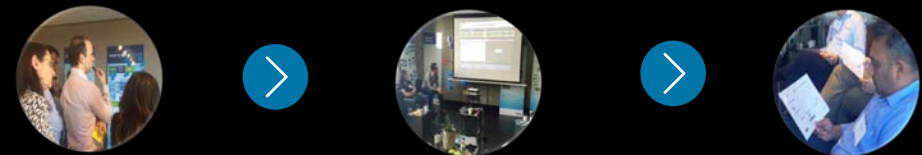
Discover the art of the possible

Exploring SAP S/4HANA in a Deloitte Greenhouse lab can help key stakeholders work toward a common vision and understanding of how SAP S/4HANA can serve as a strategic platform. Our labs disrupt ordinary thinking, reveal new possibilities, and incite productive action.