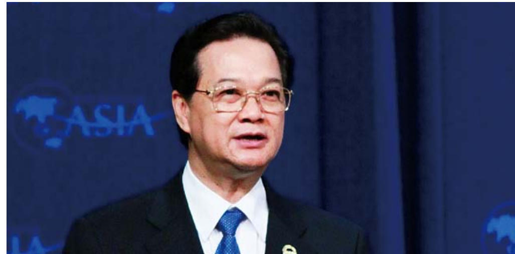
Tan Dung Nguyen Prime Minister The Socialist Republic of Vietnam

Several leaders reviewed the specific impact on their economies of the global crisis, noting that economies at every stage of development have felt some impact. Mongolia Prime Minister Sanjaagiin Bayar reported that the export decline, growing trade deficit, and decline of the national currency had put a combination of pressure on the Mongolian economy that required urgent banking reform and cost management across the board.