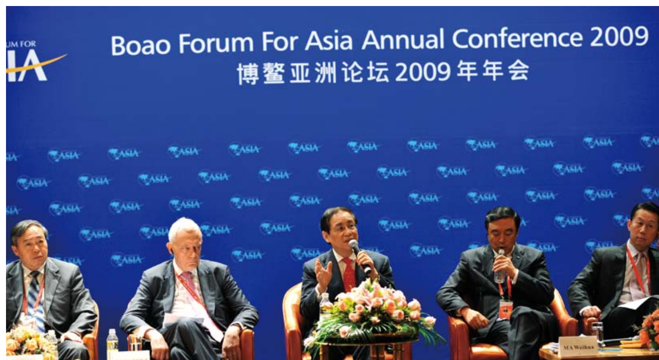
Middle: Liu Mingkang, Chairman, China Banking Regulatory Commission

Since the forum, important new legal platforms have been developed by Chinese regulators to support equity investment funds and the kinds of partnership arrangements needed to facilitate the kind of cooperation. Since the forum, China has liberalised a range of measures affecting equity investment funds, part of an effort to channel excess liquidity in the hands of large enterprises into SME growth industries.