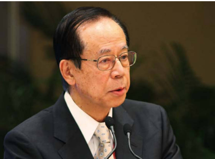
Yasuo Fukuda Former Prime Minister of Japan

In many of the panels and presentations, the serious challenges that confront fast growing Asian economies were discussed, and leaders across sectors expressed their commitments to addressing them. At the Hainan Provincial Government hosted lunch, for example, Former Prime Minister of Japan, Yasuo Fukuda stated directly that social and environmental issues could not be overlooked, even as governments focused on economic recovery.