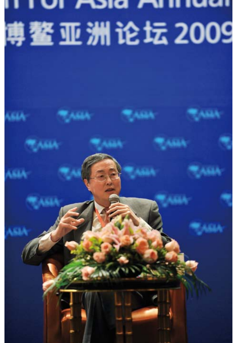
Zhou Xiaochuan Governor People's Bank of China