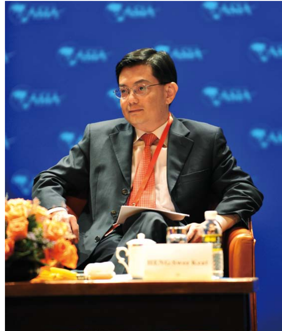
Heng Swee Keat Managing Director Monetary Authority of Singapore

It's like the Chinese have said, we have to cross the river by feeling the stones. This expression contains a lot of wisdom regarding managing the financial crisis and economic reform. Our future goals are very important, and the journey is very complex. We have to cross the river by feeling the stones.