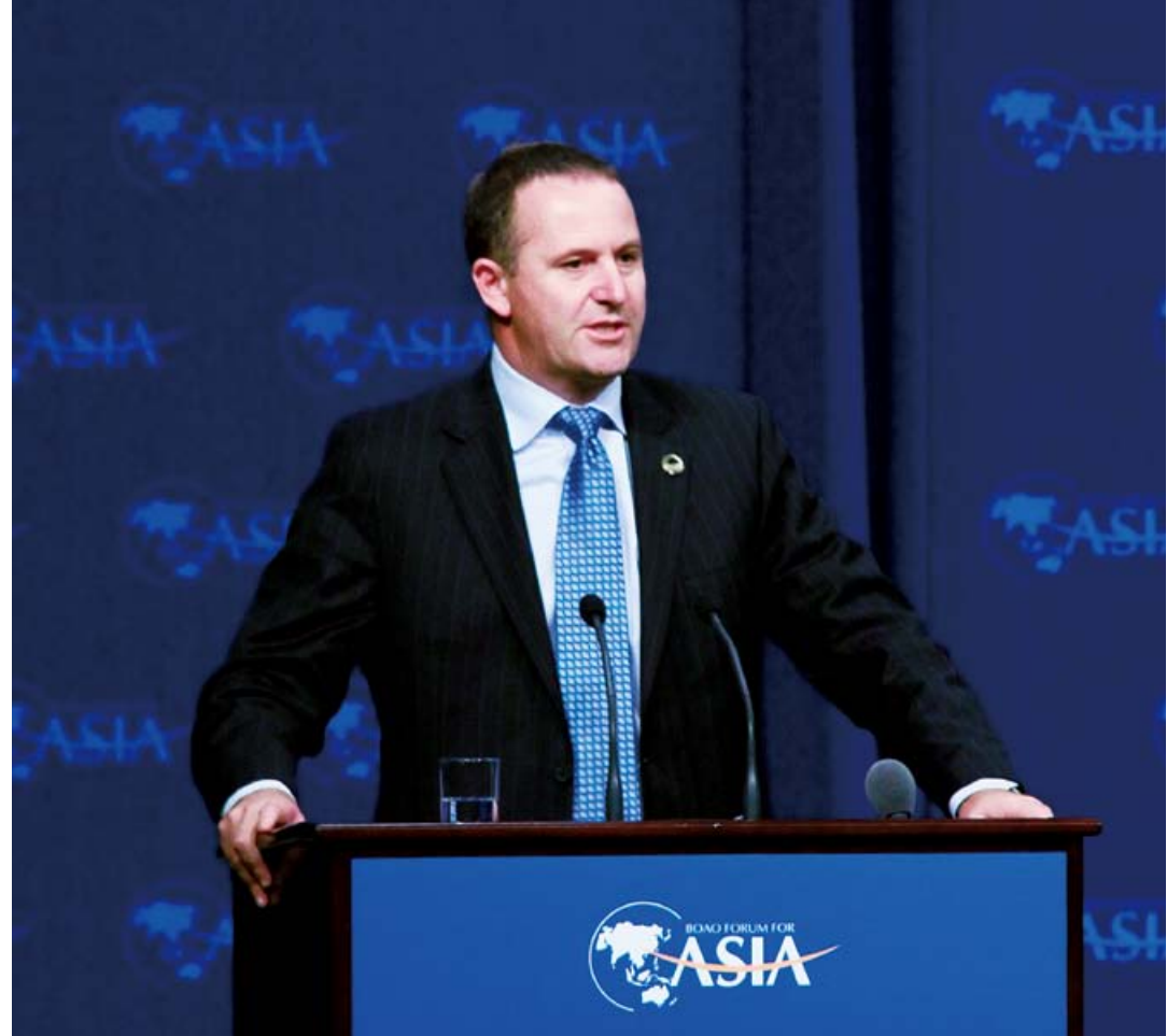
John Key Prime Minister New Zealand

Leaders in their presentations made clear that the crisis had broad impact, but the impact differed significantly from country to country, depending on the nature of the economy, size of the population, and established drivers of growth.