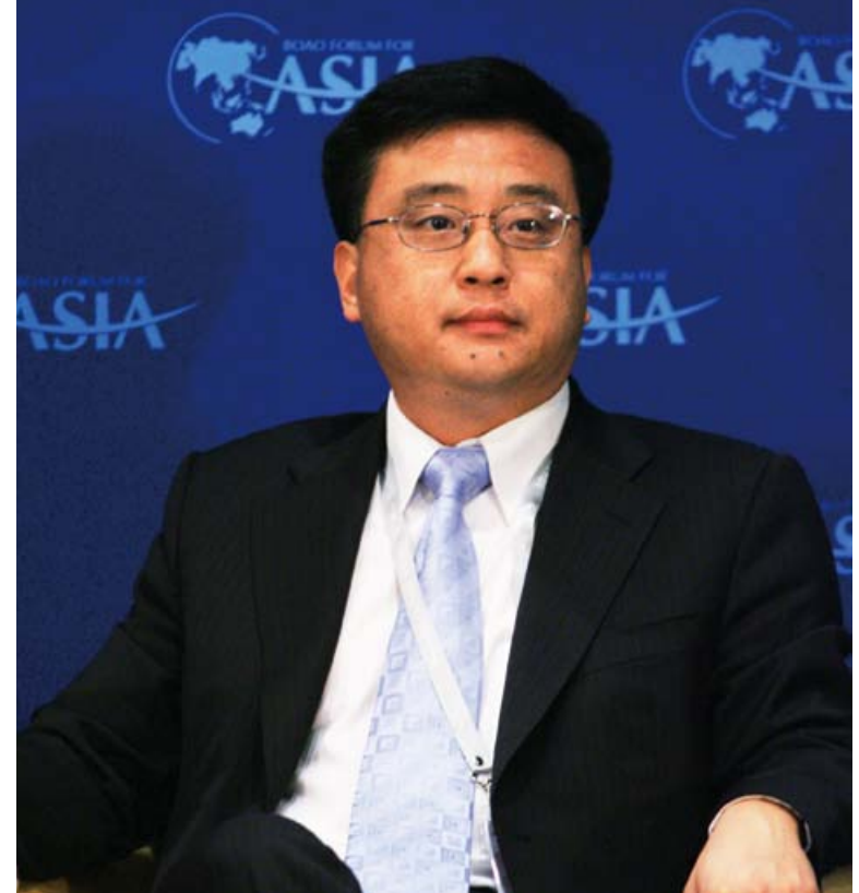
Zhang Ya-qin Corporate Vice President Microsoft

Lee Kaifu, formerly a global VP of Google and now a Founding Managing Partner of his own investment fund, argued that the internet was even a powerful tool for cost reduction during the crisis. Lee foresaw the transformation of internet usage and search functionality, with a future of mobility, individuation and intelligence as strong trends providing new business service opportunities. Ding Lei, CEO of Netease, looked to the spread of 3G capacity and usage as a major force of future transformation of many elements in Asian economies.