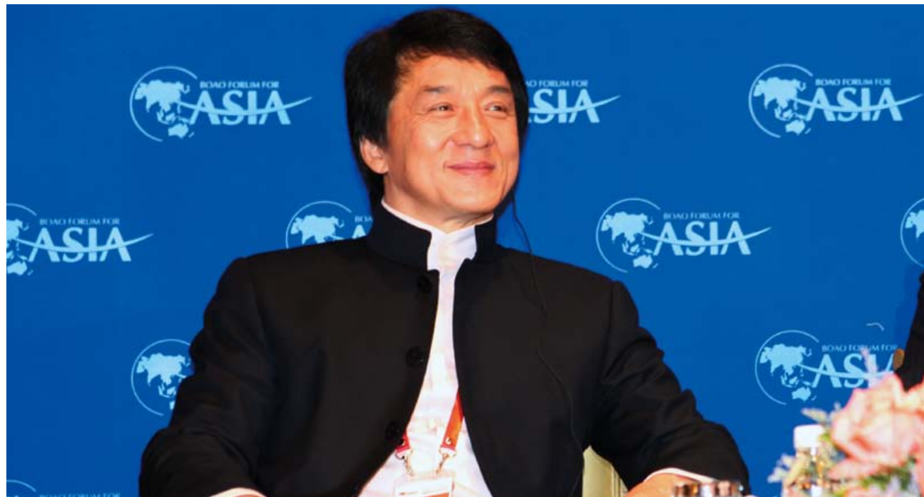
Jackie Chan Vice Chairman China Film Association