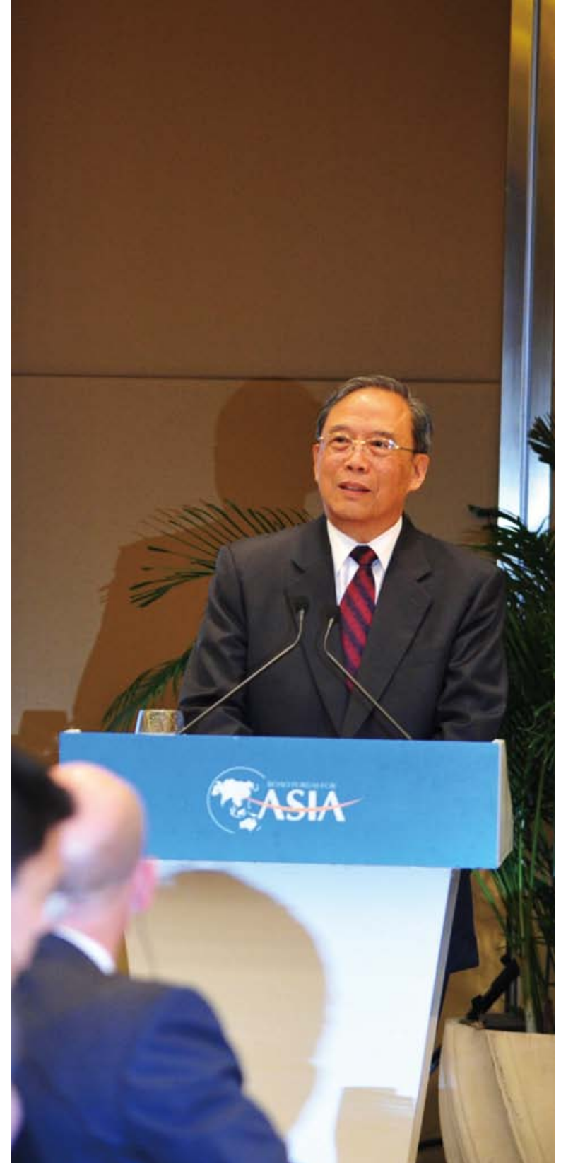
Zeng Peiyan Vice Chairman, Board of the Boao Forum for Asia Former Vice Premier, China

We hope the next round of world economic growth will be led by green recovery instead of being a simple repeat of the previous economic cycles