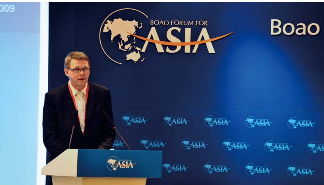
Matti Vanhanen Prime Minister Finland

We all are concerned about the conflicts between government economic stimulation plan and environment protection, therefore it is very important to increase R&D investment and develop innovative and clean technology