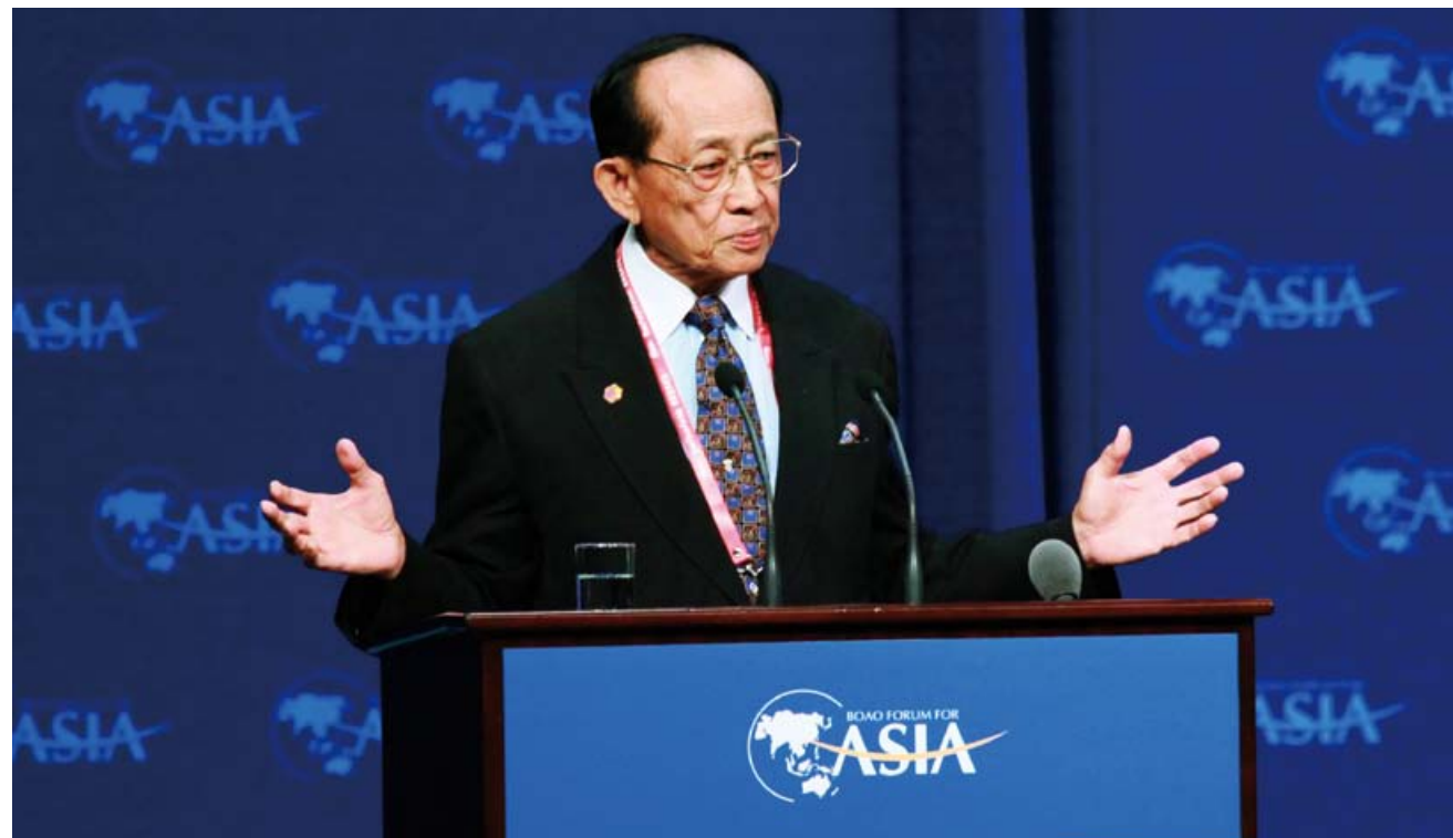
Fidel Ramos Chairman of the Board of the Boao Forum for Asia Former President of the Philippines

The economic crisis confronting the world today is the gravest and most complex of the problems challenging our generation