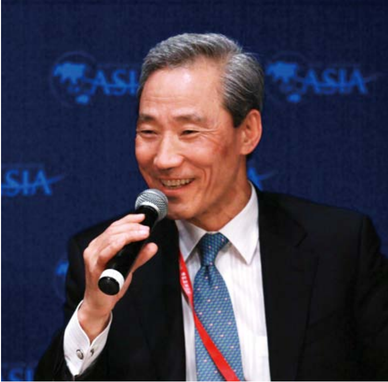
Kim Jong-hoon Minister of Trade Republic of Korea

On foreign currency and global reserve issues, Nouriel Roubini, Professor of Economics from the Stern School of New York University, has made several important points. Professor Roubini gained international attention as one of the few economists to predict the financial crisis. In his comments on the financial system panel, he cautioned that the US and Europe might begin a recovery next year, but energy and commodity price surges could prove a significant risk. On foreign currency, he supported the value of seeking alternatives to a single national currency as the sole reserve. As Roubini put it, a super-sovereign international reserve currency is a constructive suggestion for the international financial system, but it would take time to actually realise such a system.