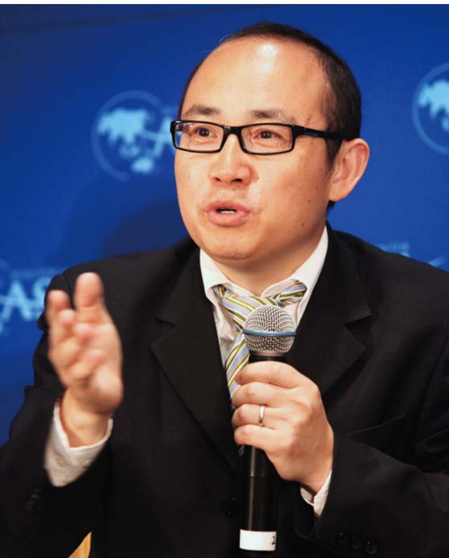
Pan Shiyi Chairman SOHO China Ltd

...In the present situation, the promoting of government policy is like fresh food, there is a certain period where freshness can be guaranteed. That is to say, taking steps before the end of 2009 will be effective. Afterwards they will not be. Why is this the case? Because we hope that in the course of 2009 the economy does not slide into an even more serious crisis.