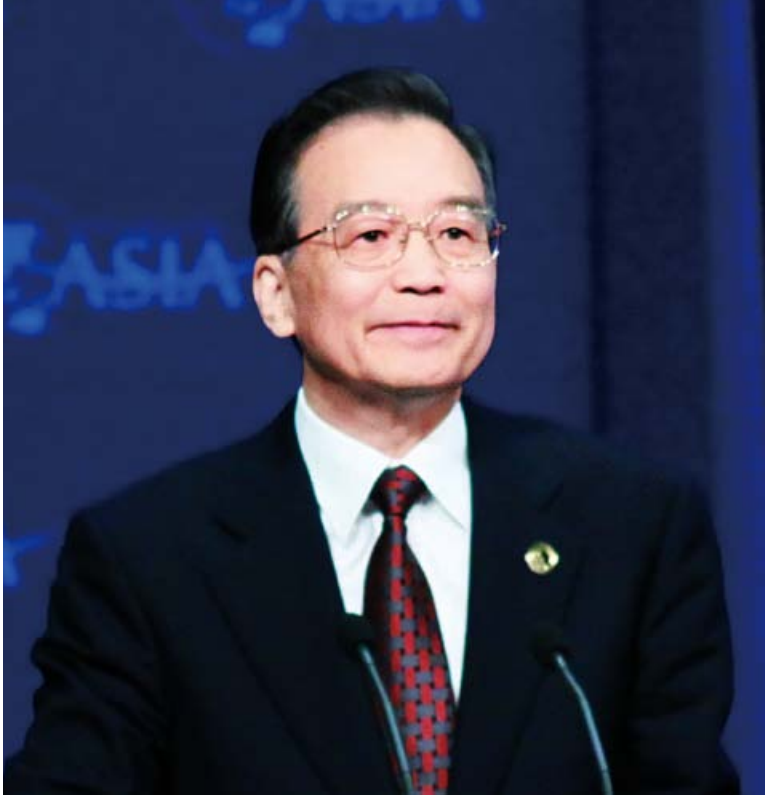
Wen Jiabao Premier People's Republic of China

...I have said before, confidence is more important than gold and money. Today, I want to say something more, something about hope. Hope is like a bright beacon that illuminates a direction for our countries, our enterprises, and the people of the world, and it is a lamp that will never go out.