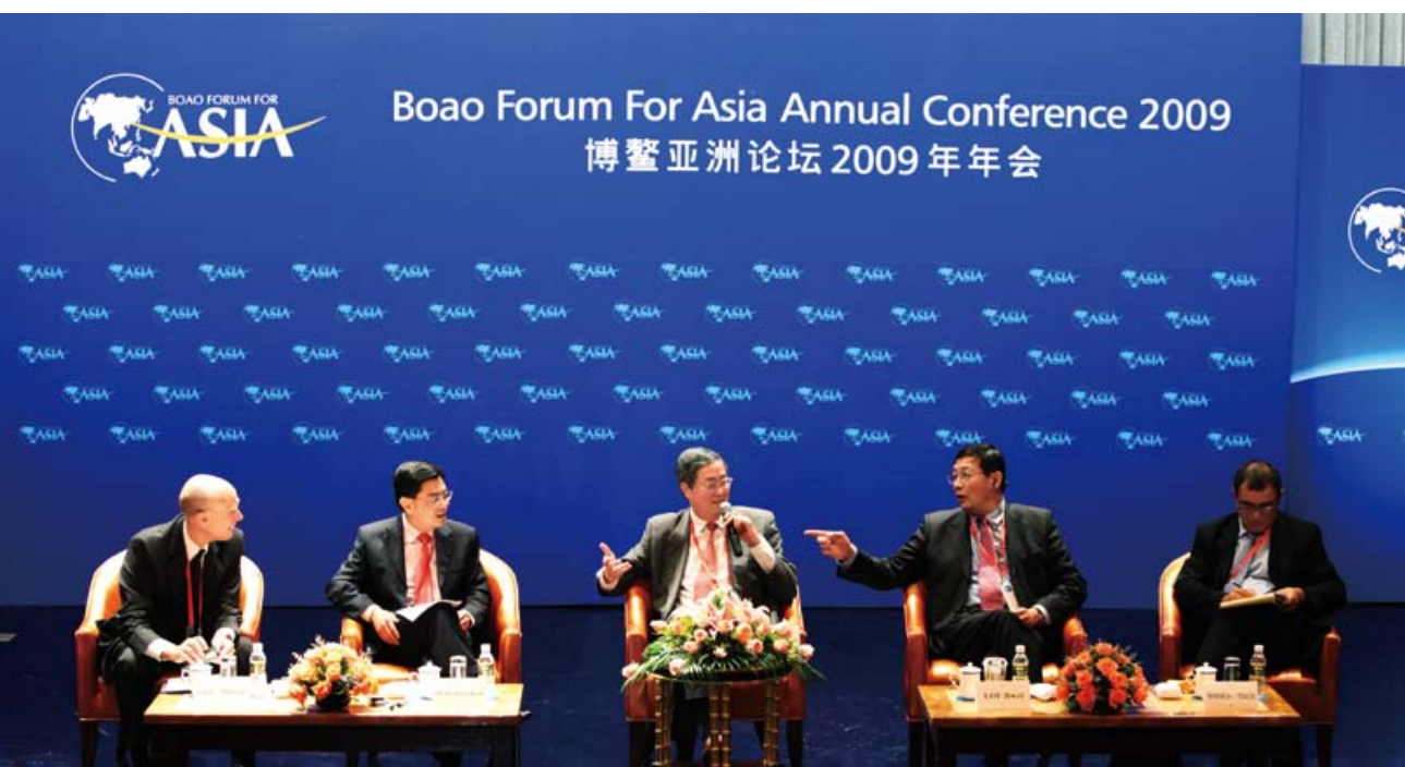
Second from right: Lou Jiwei, Chairman and CEO, China Investment Corporation

Generally there was a consensus that strong government action was called for, given the severity of the current crisis, but it was equally important to find the right point for governments to withdraw strong stimulation from their economies and return to a regulatory norm. Former Prime Minister Fukuda made this point clearly at the Hainan Provincial Government luncheon. Quick and strong responses from governments are necessary and effective in dealing with the global financial crisis. However, all this should be pulled back when things are getting better in order for countries to achieve sustainable growth. Economist Xu Xiaonian and others linked the proper timing of government retraction from high active stimulus activity to success in achieving a sustainable new economic model.