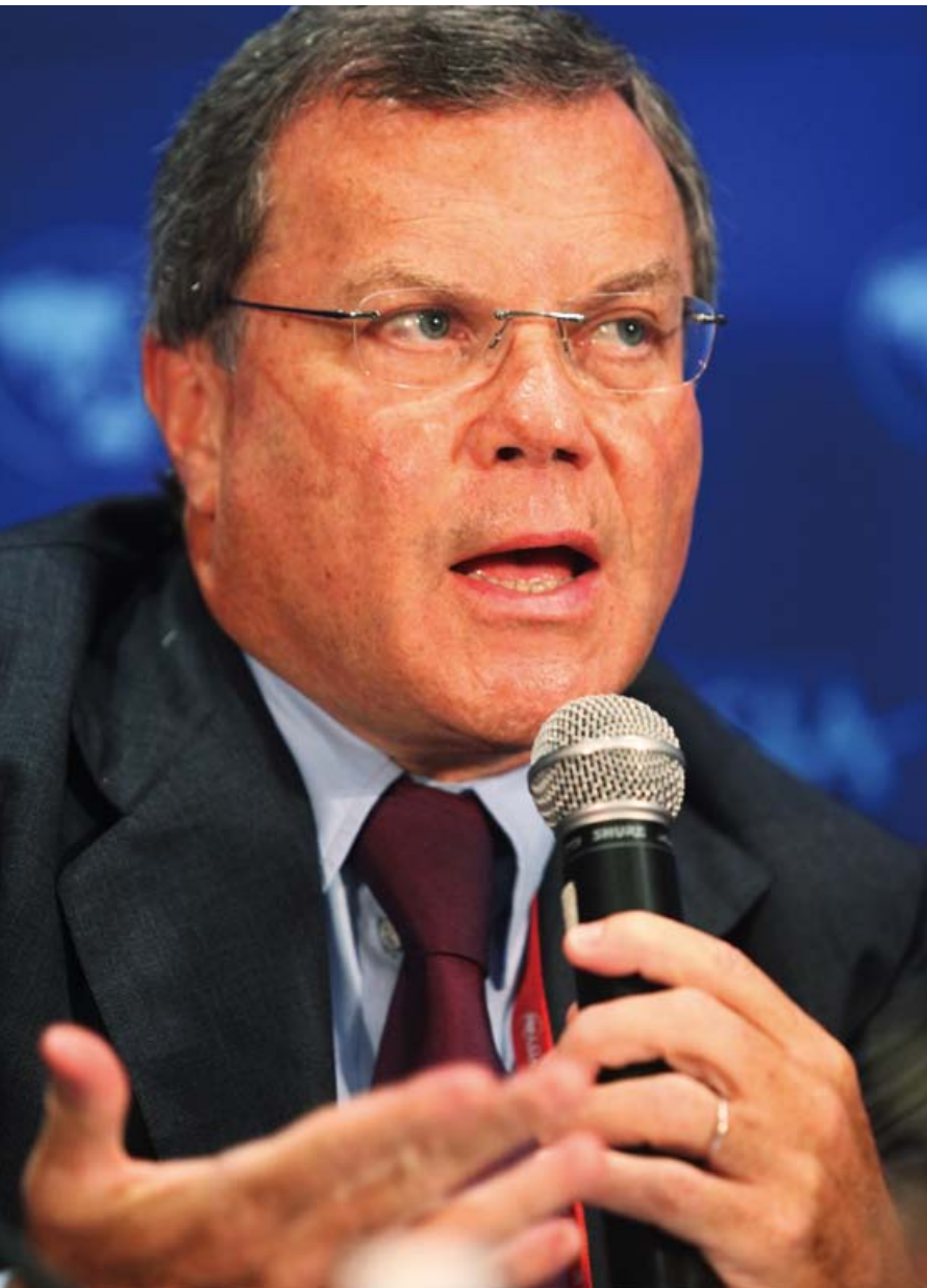
Sir Martin Sorrell Chairman WPP

The world should stop thinking about things being 'made in China,' and start getting used to the phrase 'created in China.' There is a big and important difference.