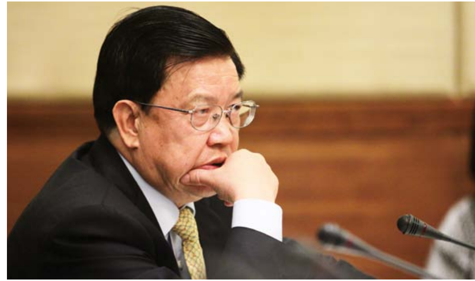
Long Yongtu Secretary General Boao Forum for Asia

There was a clarity of purpose and attitude among the senior officials and executives who spoke in the Opening Plenary session, making a persuasive case that the emerging economies, so strongly represented on the panel, were committed to working together, open to innovation, and ready to accept a major role in the new global financial system. In his closing remarks, Secretary General Long Yongtu reminded the delegates of the two most important words that had echoed through all the presentations, "confidence" and "hope." These rich discussions in the Opening Plenary set the stage for the remainder of the 2009 Boao Forum for Asia.