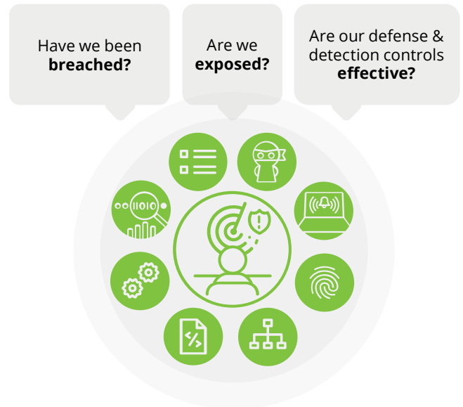
Deloitte's Compromise Assessment & Threat Hunting

Deloitte's Compromise Assessment & Threat Hunting is a technical breach detection service that helps you identify hidden compromised systems and hosts in your environment before (proactive), during (reactive) or after (post-incident) incident response.