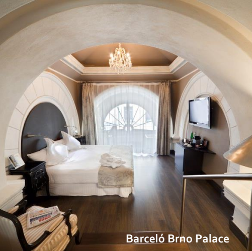
Barceló Brno Palace