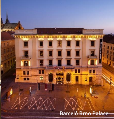
Barceló Brno Palace