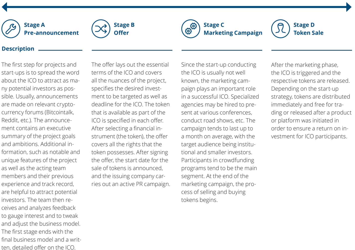
Figure 1: Stages of ICOs

Nevertheless, we have seen the majority of the ICOs follow a sequenced approach in four phases: