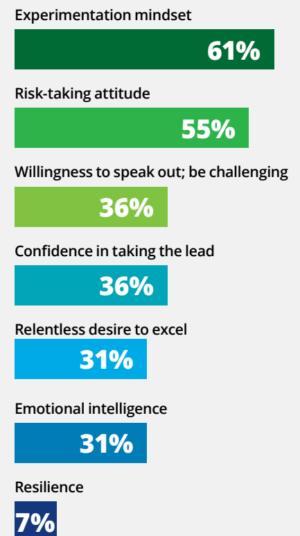
Figure 2. Which leadership attributes do your organization's leaders need more of to drive digital business transformation? (Please select top three)