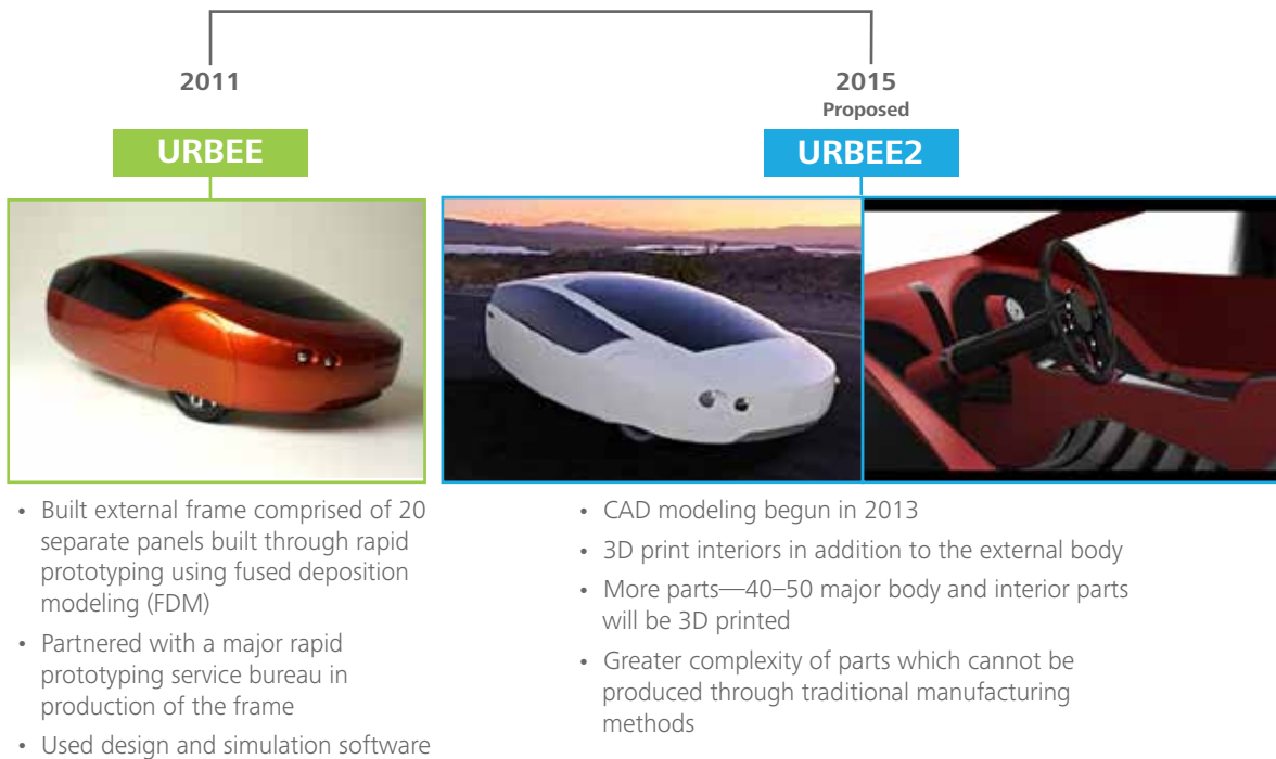
Figure 3. Urbee, the first AM-produced car