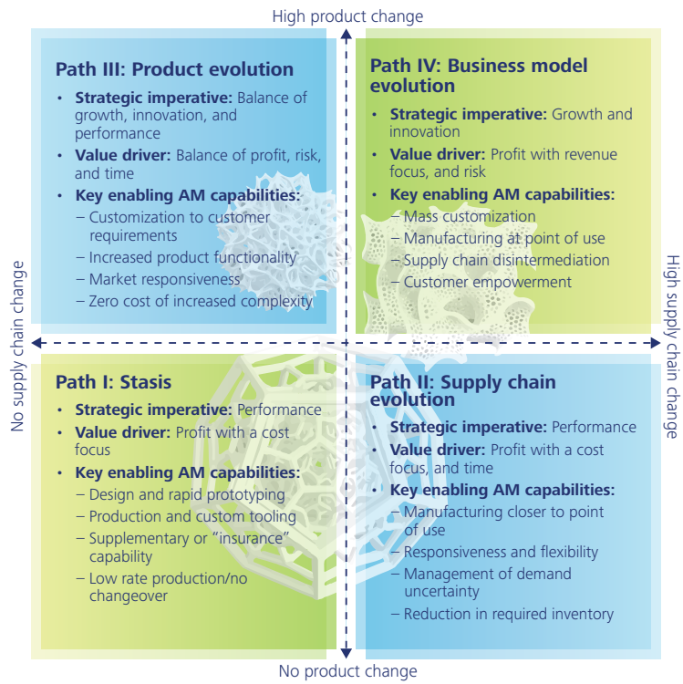
Figure 1. Framework for understanding AM paths and value