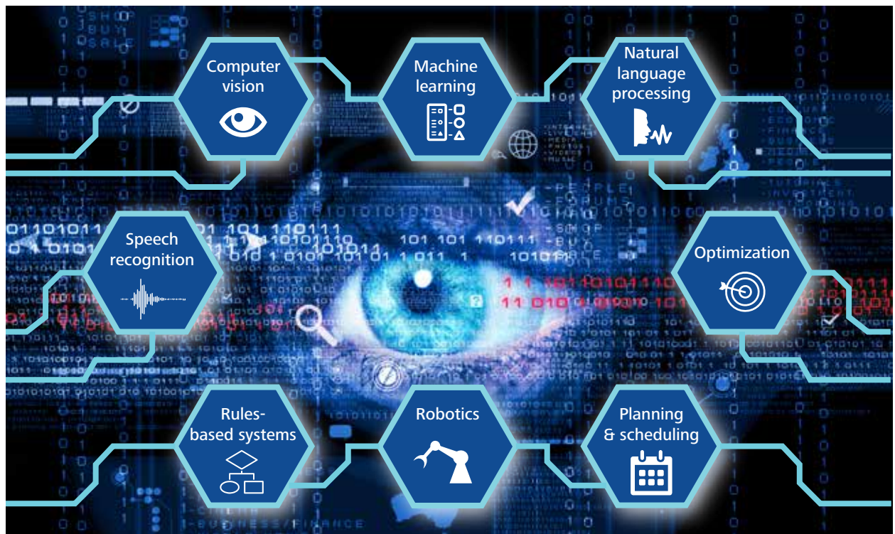
Figure 1. Widely used cognitive technologies

players—just about every technology subsector has seen a substantial upsurge of activity in this space. In fact, the race to invest in artificial intelligence has been described as “the latest Silicon Valley arms race.” 3 Since 2012, there have been 100 mergers and acquisitions (M&A) within the technology sector involving cognitive technology companies, products, and services. 4 And this rush of M&A activity is not the only sign of the industry’s interest. Many capabilities that were only just emerging a few years ago are now essentially mature and becoming “democratized” and more readily available for business applications. As a result, leading companies are using cognitive technologies to enhance their existing products and services, as well as to open up new markets.