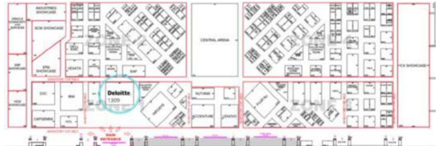
Moscone South Exhibit Hall

The Exchange is the new, reinvented central hub of Oracle OpenWorld. Serving as a beacon for the conference, it is a strategically invented space where it all comes together.