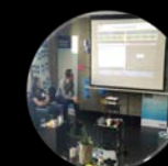
See SAP S/4HANA firsthand