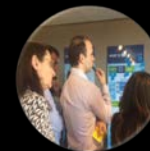
Discover the art of the possible

Exploring SAP S/4HANA in a Deloitte Greenhouse lab can help key stakeholders work toward a common vision and understanding of how SAP S/4HANA can serve as a strategic platform. Our labs disrupt ordinary thinking, reveal new possibilities, and incite productive action.