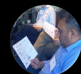
Make it real