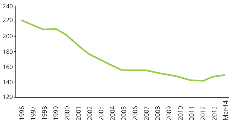
Evolution of the number of banks

In this context, Luxembourg presents outstanding opportunities thanks to its highly skilled, multilingual and multicultural workforce, its stable political environment, its dynamic legal and regulatory framework and its extensive expertise and full range of diversified and innovative financial services.