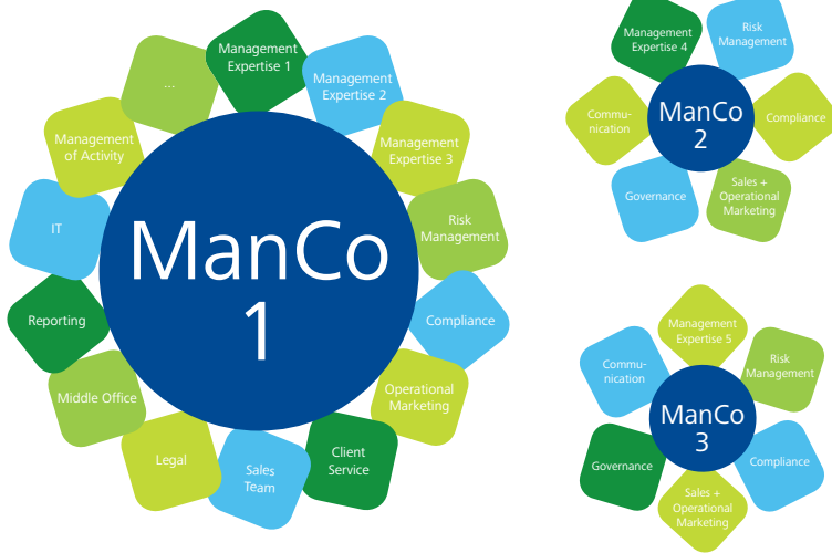
Illustration of an organisation for a management firm with locally regulated management structures

The 'Universal ManCo' model (see Performance 2013 article) is now the subject of in-depth study. The creation of a regulatory holding company naturally generates substantial economies of scale compared to locally regulated management structures.