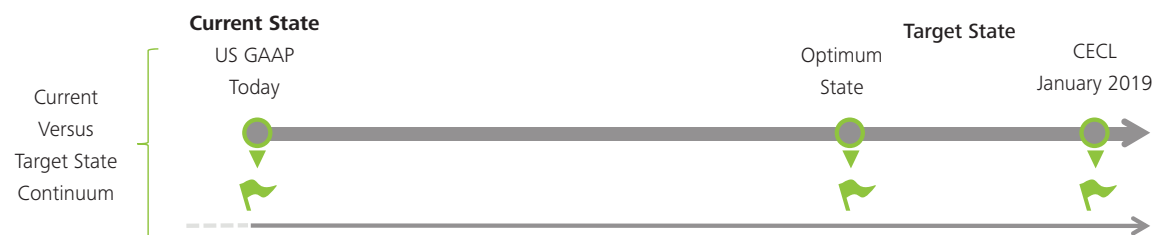
Figure 1: Transforming current capabilities related to ALL

In addition, a consistent and permeating theme throughout the 2015 AICPA National Conference on Banks & Savings Institutions (AICPA banking conference) was the focus on a financial institution's ALL and its preparation for implementing the CECL model. During the three-day conference, speakers emphasized the challenges that an entity will likely face as a result of implementing CECL, and discussed the following: