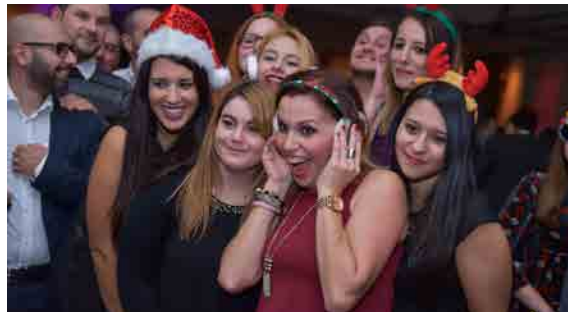
Christmas lunch and party, 2016

Each year, the firm organises a number of social activities for its staff and students. These events as well as a number of team-building activities through the year, present a great opportunity for our people to interact socially across our different service lines and functions.