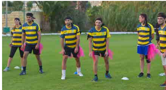
Sports Day, 2016