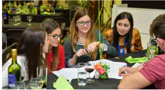
Quiz night, 2017

Secondments strengthen our organisation and offer our people unique career and personal development opportunities.