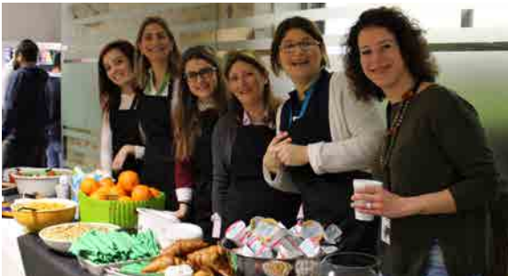
Breakfast at Deloitte, 2017