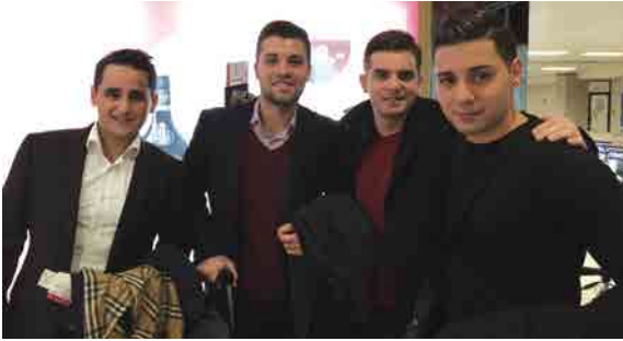
Deloitte students' 2016 overseas work experience in Deloitte London and Jersey