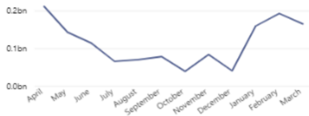
Invoice Amount (MYR) by Month