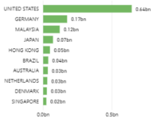
Invoice Amount (MYR) by Region