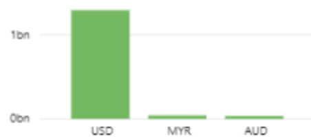
Invoice Amount (MYR) by Currency