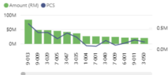
Invoice Amount (MYR) by Item Code