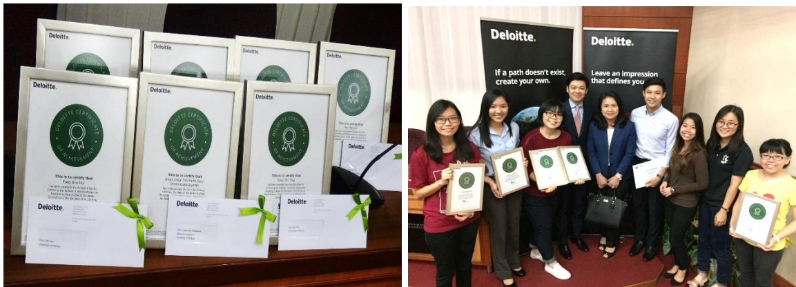
Deloitte Malaysia awards 7 book prizes to University of Malaya's Faculty of Business and Accountancy's top achievers in both the Audit and Tax papers.