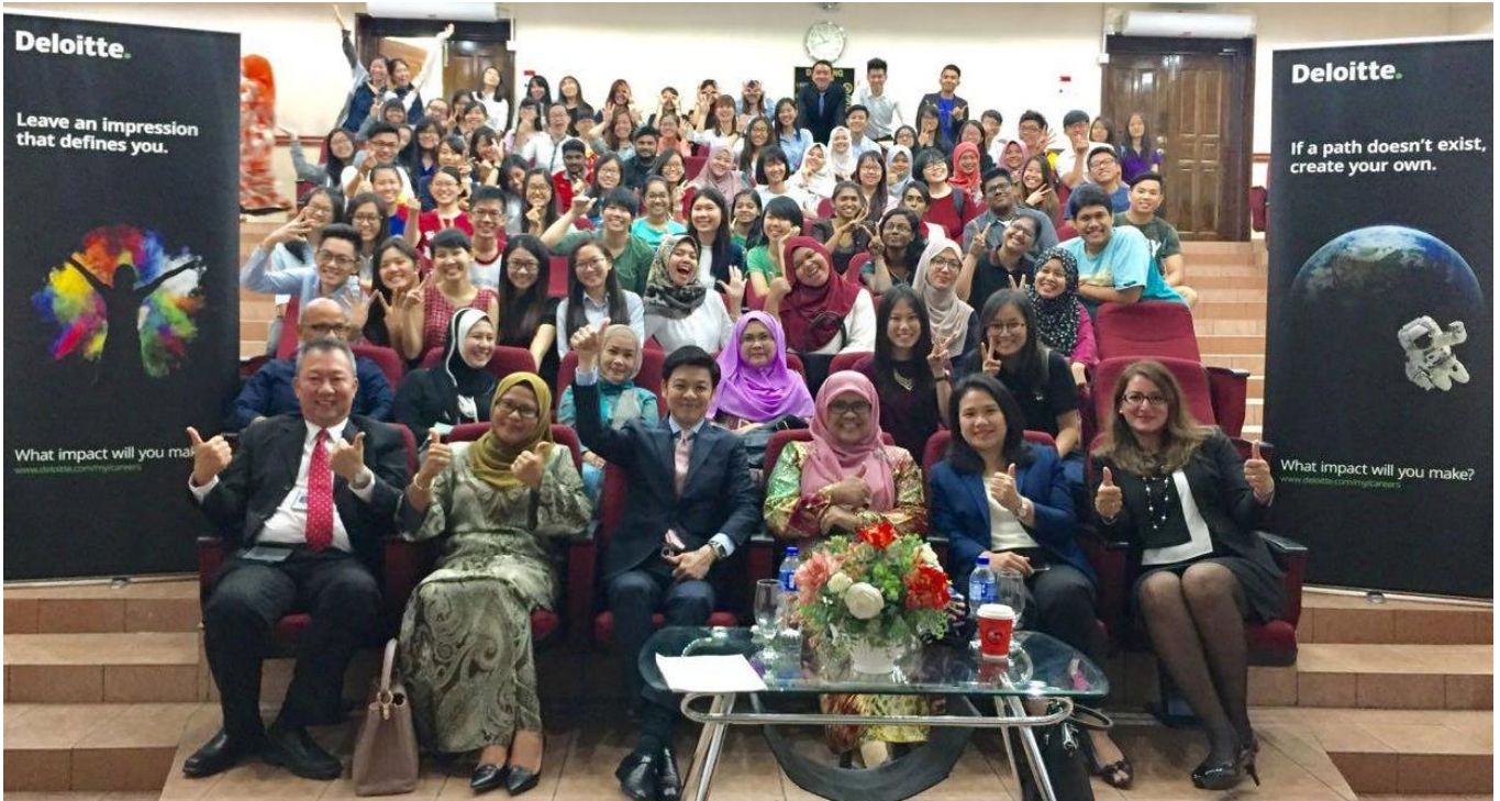
Deloitte partners pictured here with the students and faculty members of University Malaya Faculty of Business and Accounting.