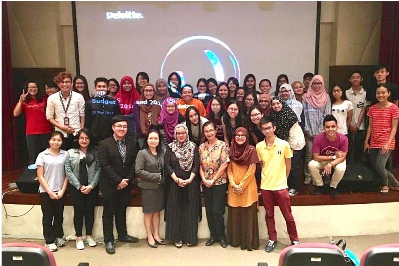
Deloitte staffs taking a group photo with the lecturers and students of UNIMAS.