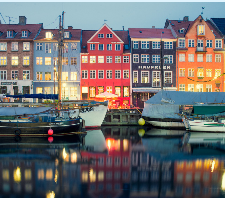
Nyhavn in the evening, Copenhagen