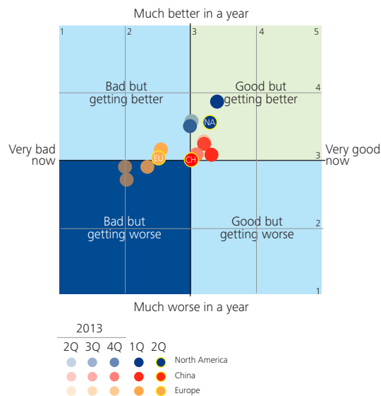
Figure 1. How do you regard the current and future status of the North American, Chinese, and European economies? CFOs' assessment based on 5-point Likert scales: "very bad" to "very good" and "much worse" to "much better" (n=109)