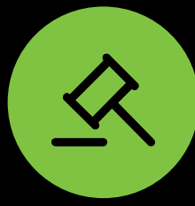
Tax & Legal