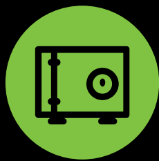
Audit & Assurance