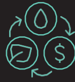
Energy/ Commodity Trading