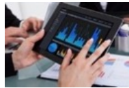
Asset Visibility & Tracking