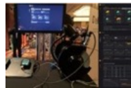
Asset Monitoring & Predictive Maintenance