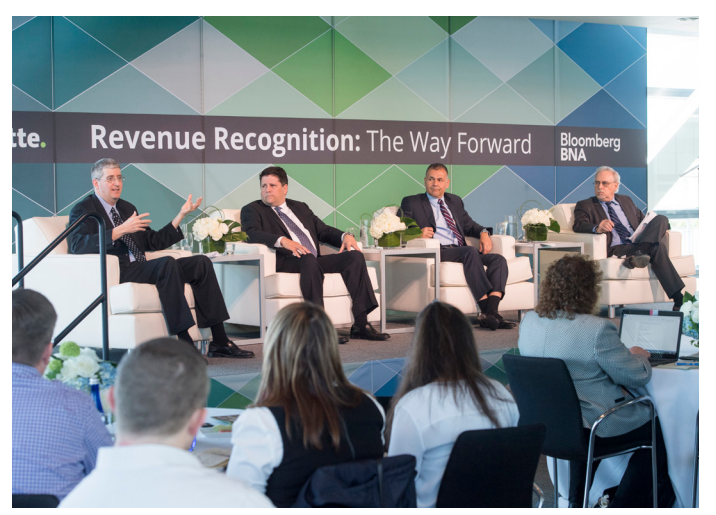
Hot Issues in Revenue Recognition panel discussion

The speakers discussed full retrospective versus modified retrospective applications and the importance of involving stakeholders. When posed the question, "What method of adoption is your company employing for the revenue recognition standard?" 37% of the respondents were unknown. 39% are adopting, or are leaning towards adopting the modified retrospective application, 24% are adopting, or are leaning towards adopting the full retrospective application.