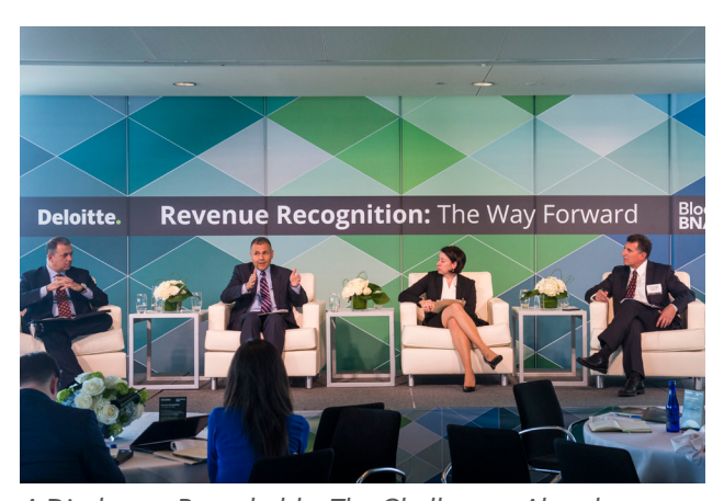
A Disclosure Roundtable: The Challenges Ahead

With the possibility of extensive, time consuming system changes required to obtain the data necessary for a company to complete the disclosure requirements of the new revenue recognition standard, preparers were advised to begin work on disclosures early. Examples of new disclosures include the remaining uncompleted performance obligations as of the end of the reporting period. Specifically, the entity must disclose the amount of the transaction price allocated to unsatisfied performance obligations and when it expects to recognize this revenue. There will be new disclosures of variable considerations,