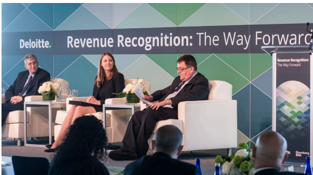
Adopting the Revenue Recognition Standard panel