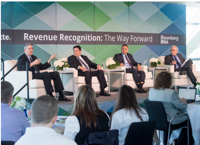
Hot Issues in Revenue Recognition panel discussion

The speakers discussed full retrospective versus modified retrospective applications and the importance of involving stakeholders. When posed the question, “What method of adoption is your company employing for the revenue recognition standard?” 37% of the respondents were unknown. 39% are adopting, or are leaning towards adopting the modified retrospective application, 24% are adopting, or are leaning towards adopting the full retrospective application.