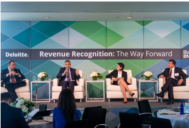
A Disclosure Roundtable: The Challenges Ahead

With the possibility of extensive, time consuming system changes required to obtain the data necessary for a company to complete the disclosure requirements of the new revenue recognition standard, preparers were advised to begin work on disclosures early. Examples of new disclosures include the remaining uncompleted performance obligations as of the end of the reporting period. Specifically, the entity must disclose the amount of the transaction price allocated to unsatisfied performance obligations and when it expects to recognize this revenue. There will be new disclosures of variable considerations,