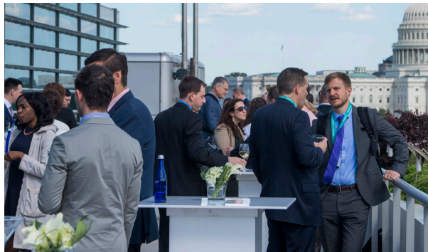
Revenue recognition colleagues network at the rooftop reception