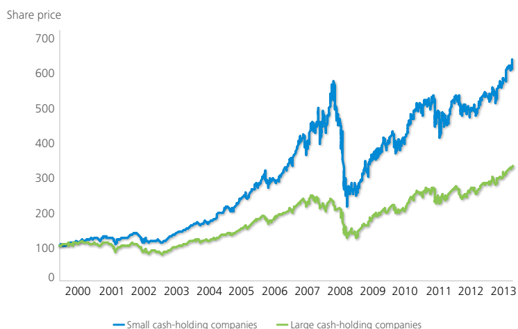
Figure 2. Relative share price performance of large cash-holding and small cash-holding companies, 2000–2013

Source: Bloomberg; Deloitte analysis. Graphic: Deloitte University Press | DUPress.com.