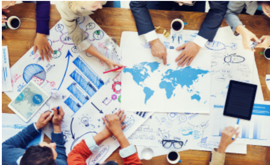
Figure 2: Creating the optimal organizational structure

ONA increases the chances that the natural leaders in your organization are on board and the transformation achieves the intended objectives.