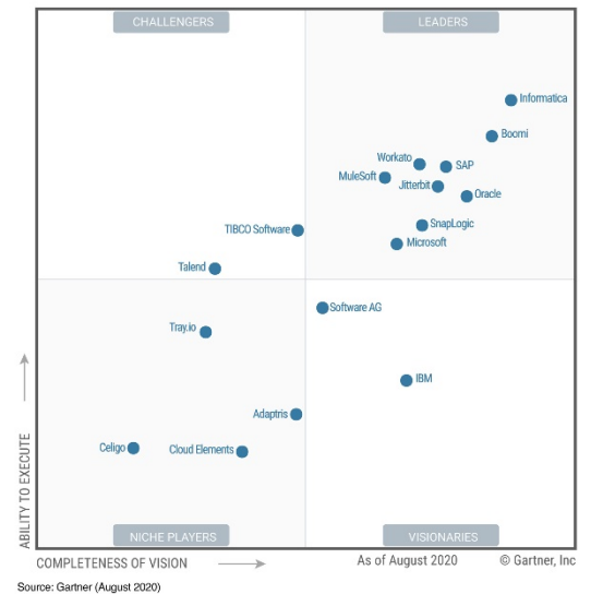
Figure 1. Magic Quadrant for Enterprise Integration Platform as a Service