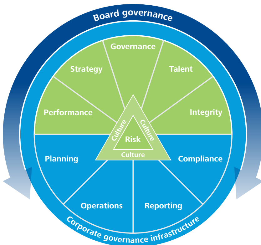
Figure 1: The Deloitte Governance Framework

The board’s oversight objectives and activities within each of these elements are generally quite similar to one another, and may consist of understanding the company’s operating models, considering their adequacy in the circumstances, and monitoring output. These same objectives and activities apply to the board’s activities for the underlying infrastructure for each of the elements at the top of the Framework.