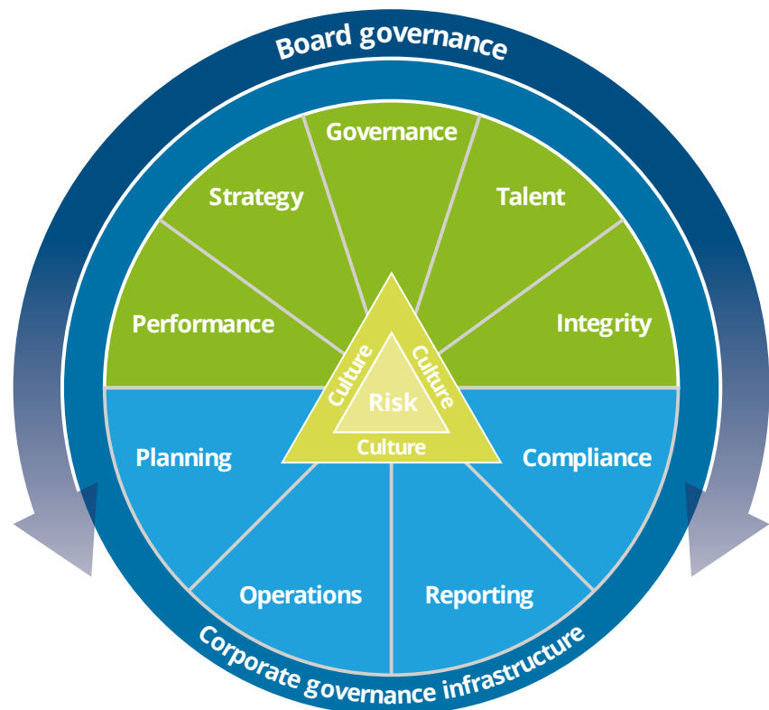
Figure 1: The Deloitte Governance Framework