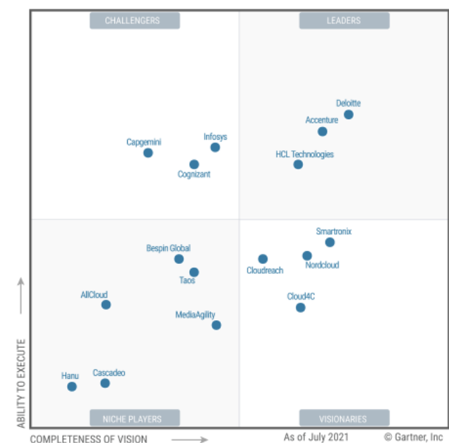
Figure 1: Magic Quadrant for Public Cloud IT Transformation Services

Deloitte is positioned as a Leader in the new 2021 Gartner® Magic Quadrant™ for Public Cloud IT Transformation Services*