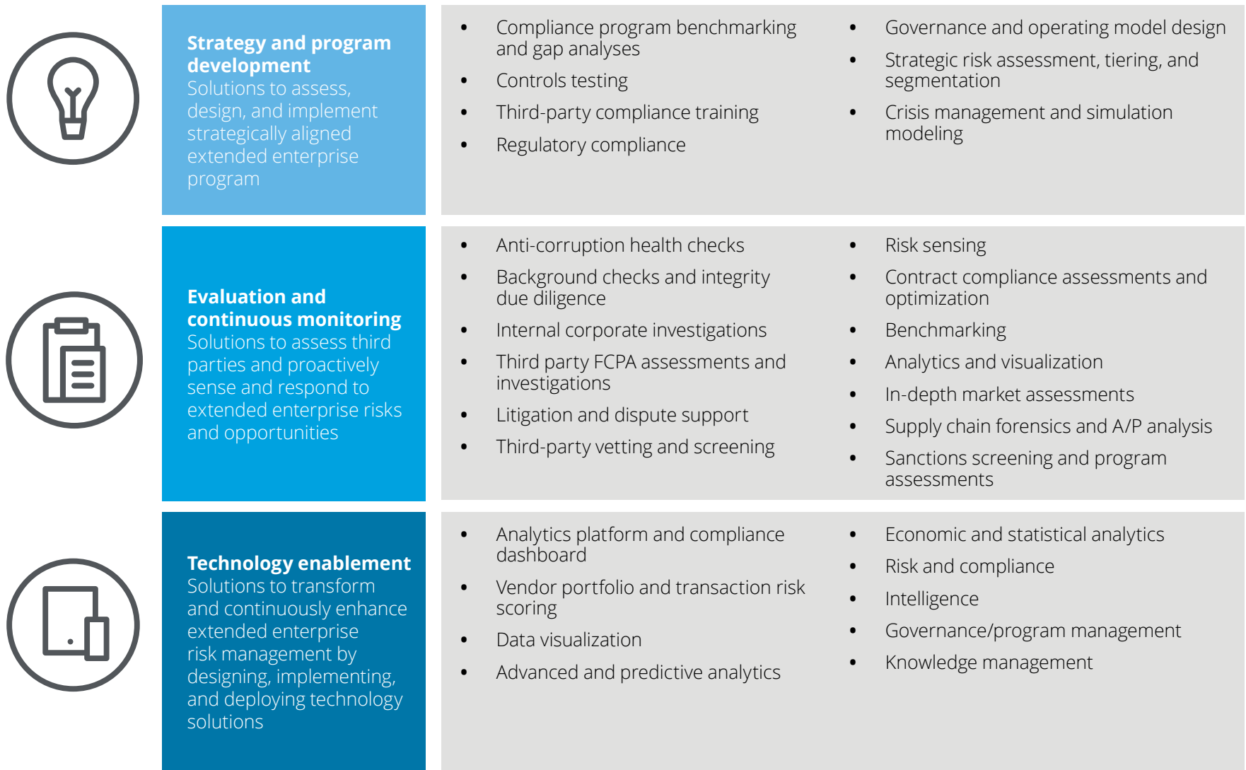
Figure 2: Deloitte Advisory's EERM framework