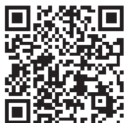
Parking for Deloitte Marathon